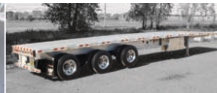
Variety of axles configuration available