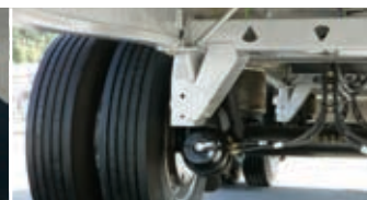
Hendrickson AANT-23 standard suspension (AANT-300 available) Benefit: Light weight