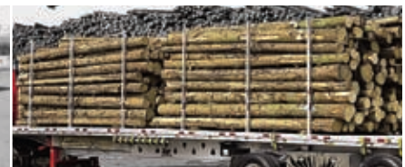
Log bunk with removable stake kit