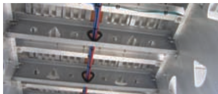
60,000 lb capacity coil package