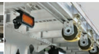
Double "L" sliding winch track up to very rear Benefit: No need for different cargo devices