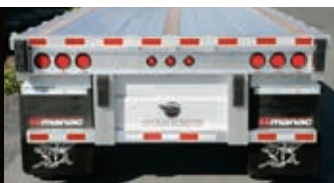
Extra crossmember at rear Benefit: 16,000 lb capacity for lift truck / dock loading