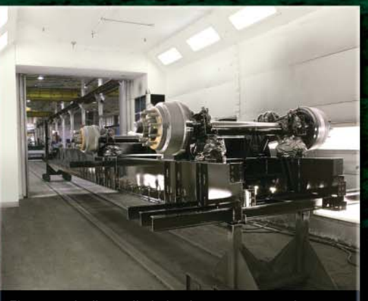
Electrostatically applied plural component urethane top coat provides superior resistance to corrosion.

ONLY FONTAINE® OFFERS THE XTREMEBEAM®. It's just one of many reasons why more fleets and owner operators are earning their living with Fontaine® than ever