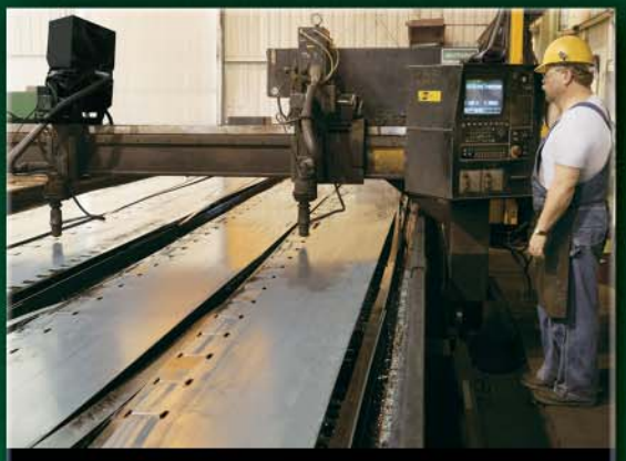
Computer controlled cutting assures the dimensional integrity of the Fontaine XtremeBeam<sup>®</sup>.

IT ALL BEGINS WITH HIGH QUALITY STEEL THAT IS CUT TO PERFECTION USING COMPUTER CONTROLLED PROCESSES. THE RUGGED ONE-PIECE MAIN BEAM WEB DESIGN FEATURES A GENEROUS CAMBER TO PROVIDE ADDED STRENGTH UNDER LOAD. 3/8" STEEL TOP AND BOTTOM FLANGES ARE WELDED ON BOTH SIDES OF THE BEAM USING ROBOTICS TECHNOLOGY. THIS