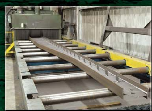
Paint adhesion is dramatically improved by an automated cleaning process.

BEFORE. THEY KNOW THAT FONTAINE<sup>®</sup> OFFERS