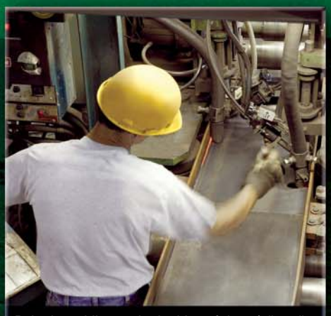
Robotic welding on both sides of the 3/8" x 5" top and bottom flange provides greater strength.

TAKES THE GUESSWORK OUT OF THE PROCESS TO GIVE OUR CUSTOMERS CONSISTENT QUALITY AND SUPERIOR WELD INTEGRITY. ADDITIONAL STEEL